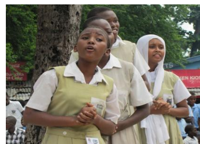
Pupils recite a poem for the competitions

Remarkably technical issues of biodiversity,